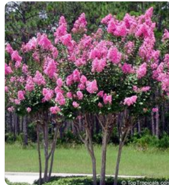
Pink Crape Myrtle Varieties | Lagerstroemia indica, Crape Myrtle, Crepe Myrtle - TopTropicals.com