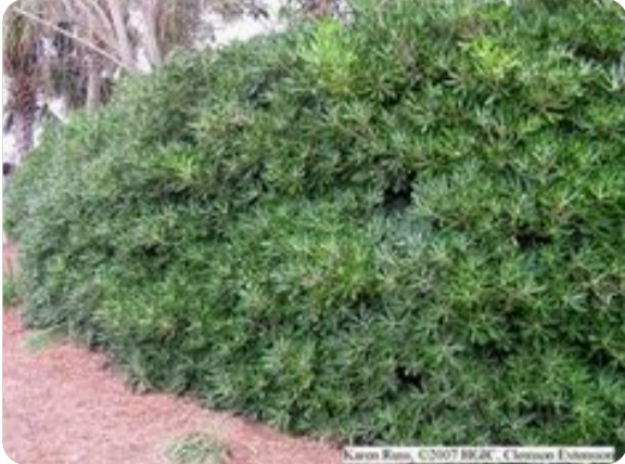
Japanese Pittosporum 5