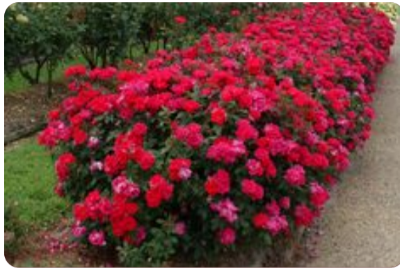
Double Knock out roses - the least demanding rose ever. Blooms like crazy all summer long, no deadheading required. Fills up a flower bed. Plant 3 feet apart, prune in spring to keep bush size under control. Planted in full sun. Plant with blue salvia, daisies, and dianthus. I planted a climber - purple jackmanii at the base of each plant to let it grow up and through the branches in the hopes it will twine onto the deck.