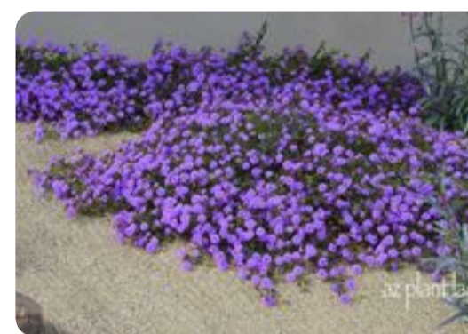
Purple Trailing Lantana