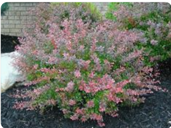
Barberry Concorde Crimson Pigmy 18-24'H 36'W Saved from ebay.com 9