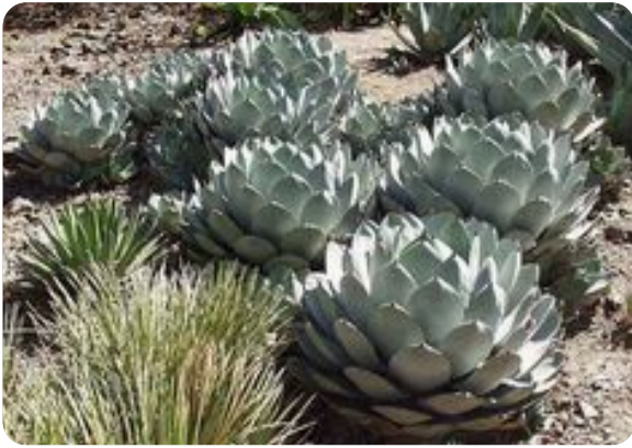
Agave Parryi Saved from smgrowers.com 9