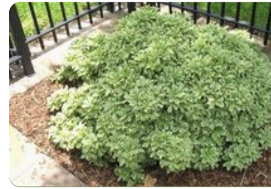
Variegated Pittosporum Saved from gardenality.com