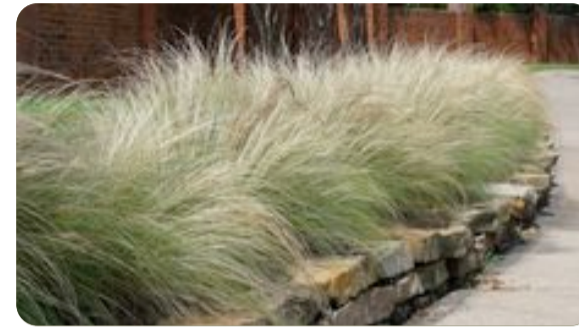
Mexican Feathergrass - drought-tolerant, 1-2' wide, 1-2' tall, sun/part shade, cutting back optional; soft, elegant weeping form; effective individually or in masses