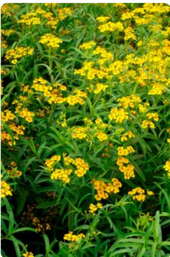
Mexican Mint Marigold