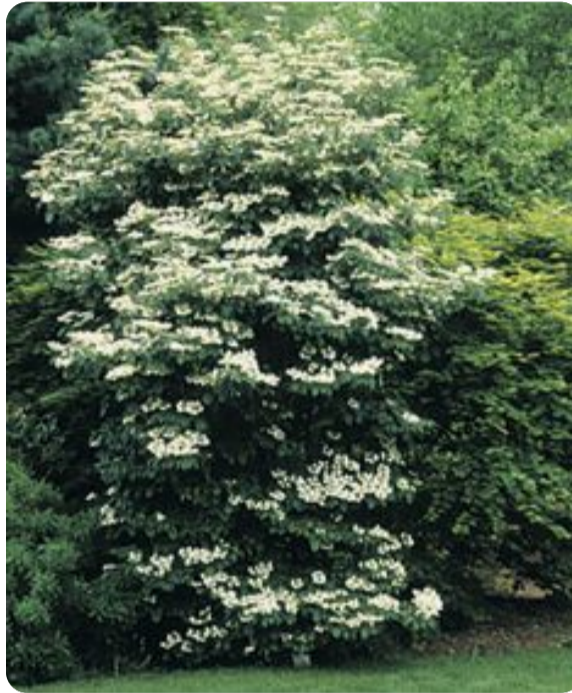
Viburnum Saved from finegardening.com 2.4k