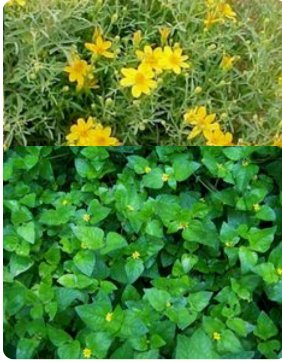
Horse Herb 2