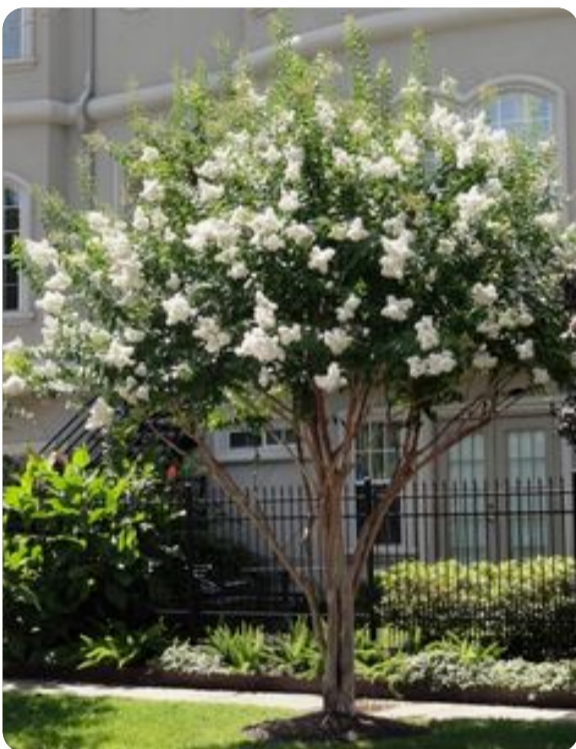
Neches crape myrtle tree | Natchez' Crape Myrtle | Picture Plants