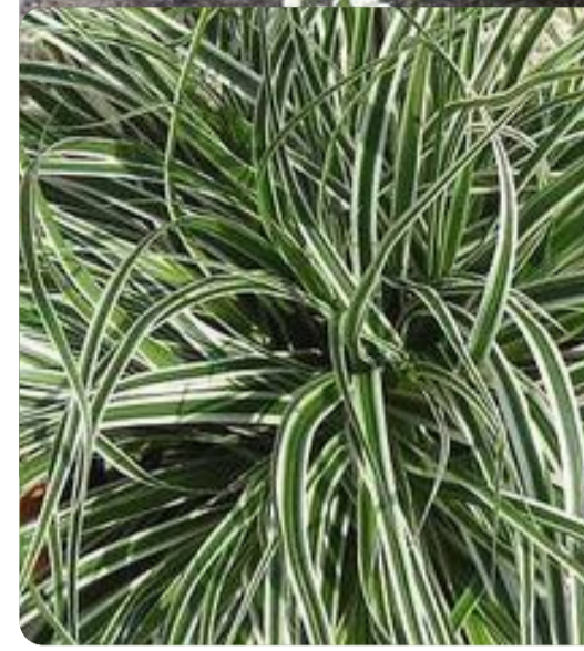
Variegated Japanese Sedge