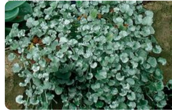
Silver Ponyfoot 8