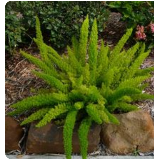
Foxtail Asparagus Fern - adds great texture for my partial-shade beds